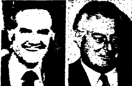
The men who worry Asians: U.S. Democratic candidate George McGovern (left) and Australian Labour Party leader Gough Whitlam.

What would happen in South-East Asia if changes result from impending elections in the United States and Australia? Asian nations have the jitters at this prospect—for at stake is the very basis of Western involvement.